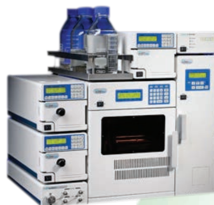
Jasco LC 2000 for detection of Nitroarenes

A family of polyaromatic hydrocarbons (PAHs) known as nitroarenes are present in automobile exhaust. These species are known to be highly mutagenic and carcinogenic. Thus, it is very important to develop good methods for the analysis of these species. In many cases the presence of interfering compounds often masks the target compounds, making highly selective and sensitive detection difficult. In this experiment, an on-line reduction system and clean-up method is employed to enhance the fluorescence and provide higher selectivity. The system allows simultaneous analysis of PAHs and nitroarenes in diesel exhaust.